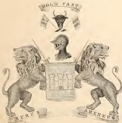
Macleod of Macleod's