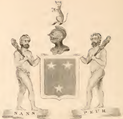
Netherlands of Fries